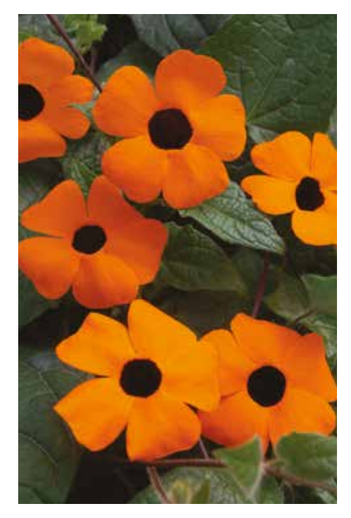
Thunbergia 'Orange Beauty' produces fiery orange hues, surrounding a deep black centre.

Thunbergias , commonly known as black-eyed Susan or Sunny Susy, are delightful, annual climbers that are covered in brilliant, vibrant flowers all summer long and into autumn. Use these fast growers to quickly clothe walls, fences, trellis or obelisks or to hide unsightly objects in the garden, either growing them in the ground or in large pots. Or grow them in hanging baskets, where their long stems will provide a cascade of colour.