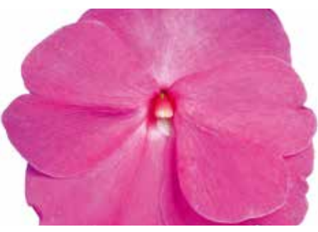
Magnifico 'Lavender' is lavender in colour. Height 30cm (12in), Spread 35cm (14in). J00076