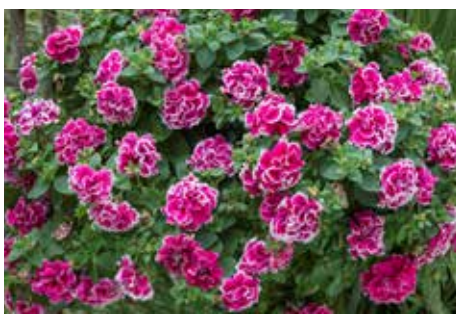
Petunia 'Tumbelina Anna' is a pink and white bicolour mix. Height 40cm (16in), Spread 35cm (14in). J00072