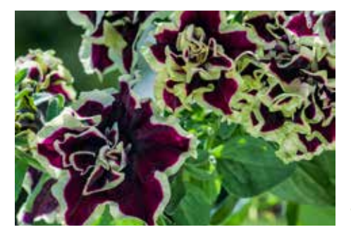
Petunia 'Tumbelina Superstar' is deep crimson rose with a white rim. Height 40cm (16in), Spread 35cm (14in). J00072