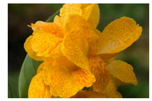
Canna 'CannaSol Happy Emily' bears sunny yellow flowers with attractive, darker, dappled patterns.

Height 23cm (9in), Spread 30cm (12in). J00184