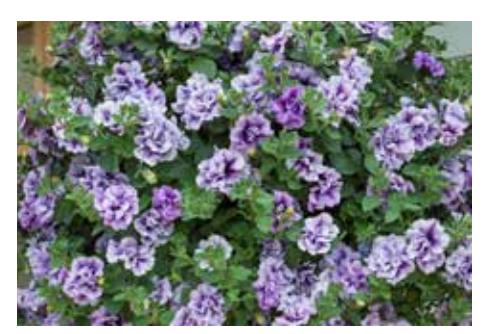
Petunia 'Tumbelina Priscilla' is soft lavender. Height 40cm (16in), Spread 35cm (14in). J00072

These fabulous trailing petunias have the most beautiful, scented, double flowers and flourish whatever the weather. Gently hugging the sides of baskets and patio pots, they look as beautiful as they smell, and have a very neat habit, without becoming straggly.