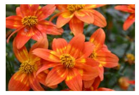
Bidens 'Spicy Margarita' is a hot, fiery orange, to almost red, with a distinct yellow halo around the central eye. Height 30cm (12in), Spread 30cm (12in).