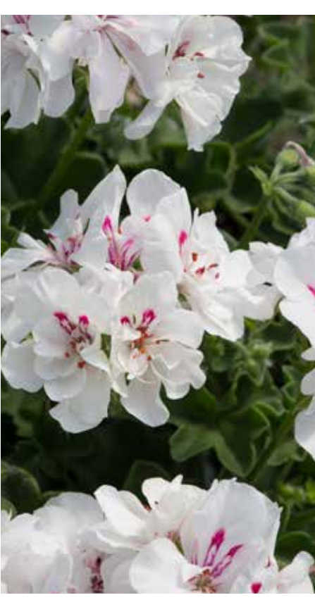
Geranium 'Precision White' is a lovely white with hints of light pink. Height 30cm (12in), Spread 45cm (18in). J00074

UK Plant Passport A Pelargonium B 130137 C 2021020224 D GB