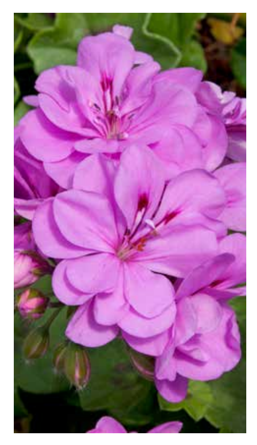
Geranium 'Precision Amethyst' is covered in dusky, dark pink flowers. Height 30cm (12in), Spread 45cm (18in). J00074

Geranium Precision is a stunning range, perfectly suited to British summers. The large, semi-double blooms are set off against glossy, dark green leaves. It's a must-have for baskets and containers.