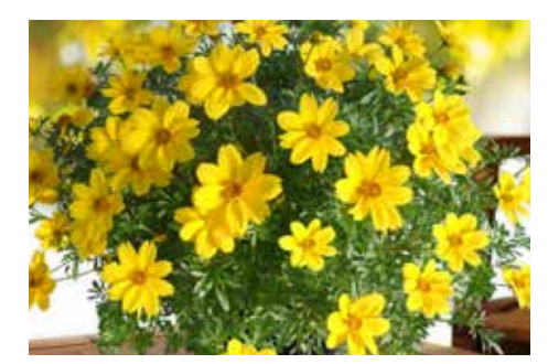
Bidens 'Rockstar' has huge, canary-yellow flowers and lush green foliage. Height 30cm (12in), Spread 30cm (12in).

Bidens bring masses of colour to the garden throughout summer and well into autumn. Grow them in the ground in beds or borders, or in containers. They'll gently tumble over the edges of containers, softening their edges, or spill down the sides of hanging baskets, creating a colourful floral waterfall.