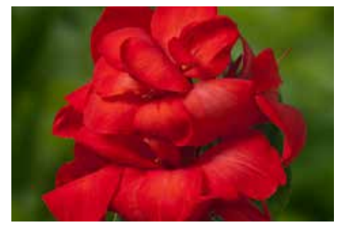
Canna 'CannaSol Happy Carmen' has deep-red flowers. Height 23cm (9in), Spread 30cm (12in). J00184

Canna lilies bring a touch of tropical and exotic colour to gardens in summer and early autumn, thanks to their brightly coloured flowers and attractive, ornamental foliage. These CannaSol varieties are bred to produce large, self-cleaning flowers that continue blooming throughout summer and early autumn, on short plants. This makes them ideal for growing in pots and other containers, as well as in beds and borders.