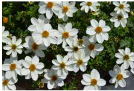
Bidens 'Spicy Ice' produces pure white flowers with golden centres. Height 30cm (12in), Spread 30cm (12in).