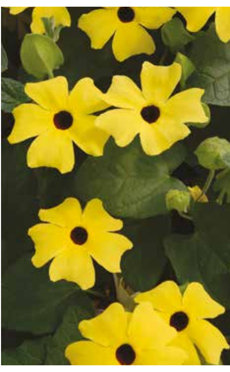
Thunbergia 'Lemon Beauty' has vibrant yellow flowers with a black centre. Height 2m (6½ft), Spread 1m (1¼ft). J00089