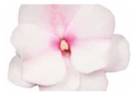
Magnifico 'Cherryblossom' is white with a touch of red in the centre. Height 30cm (12in), Spread 35cm (14in). 100076