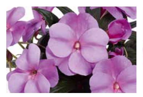
Magnifico 'Star Lavender' is pink with a purple star-shaped centre. Height 30cm (12in), Spread 35cm (14in). J00076

New Guinea impatiens are the sophisticated cousins of the lower growing Busy Lizzies. New Guinea Magnifico boasts masses of bright, vibrant flowers for months on end during summer and into autumn among excellent foliage. The bushy, compact plants produce an abundance of large flowers. Grow it as a bedding plant in beds and borders or use it as a centrepiece in pots and containers. Grows well in sun or part shade.